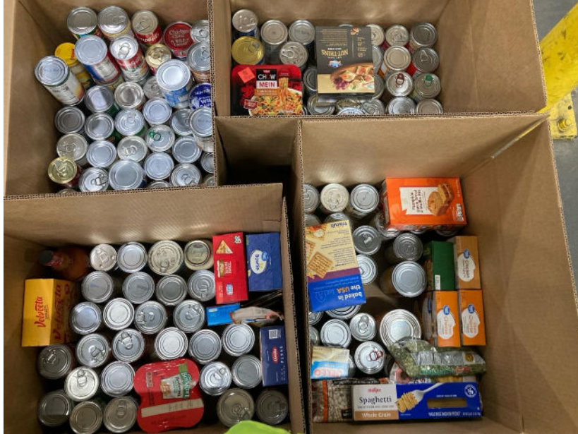
Just some of the non-perishable food collected by our SAPS coworkers.